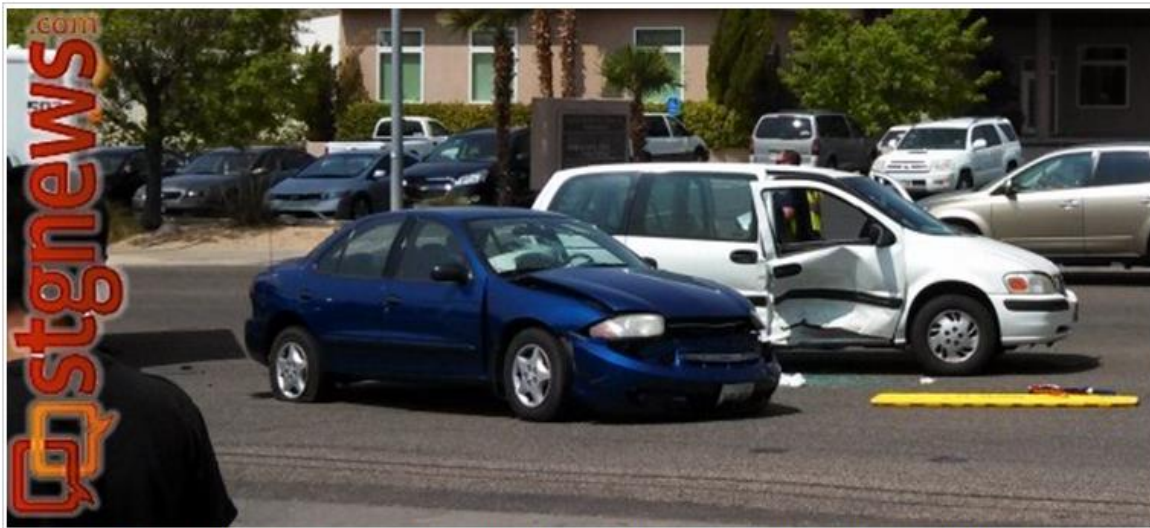
A three-vehicle accident sent two people the hospital and left another with a citation for distracted driving. St. George, Utah, June 3, 2013