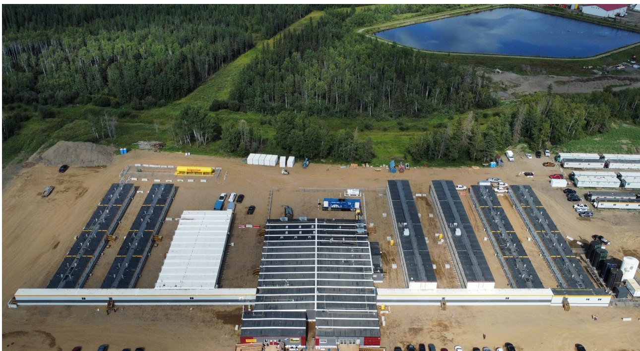
Fire Relief Camp, High Level, Alberta, Canada

Additionally, following the conclusion of TMEP's rental term in the second quarter of 2023, the workforce housing camp in Valemount, BC was re-mobilized to support people displaced by wildfires. The rental term commenced and concluded during the third quarter of 2023.