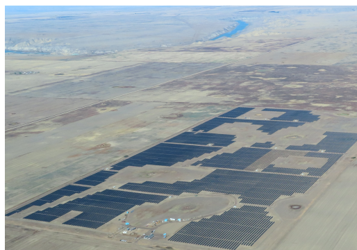
Empress solar project, Empress, Alberta, Canada

In September 2023, ATCO, through its investment in Canadian Utilities Limited, entered into a 12.5-year virtual power purchase agreement with Lafarge. Under the terms of the agreement, Lafarge's Exshaw cement plant will notionally purchase 100 per cent of the solar power generated from the 38.5-MW Empress solar project, meeting 34 per cent of the plant's power requirements through 2036. The Empress solar project achieved energization in the third quarter of 2023 and full commercial operations is expected to commence in the fourth quarter of 2023.